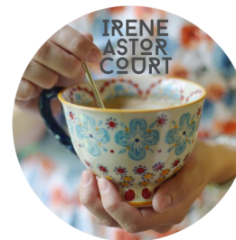
Coffee and Cakes 10.30 - 12.00 noon