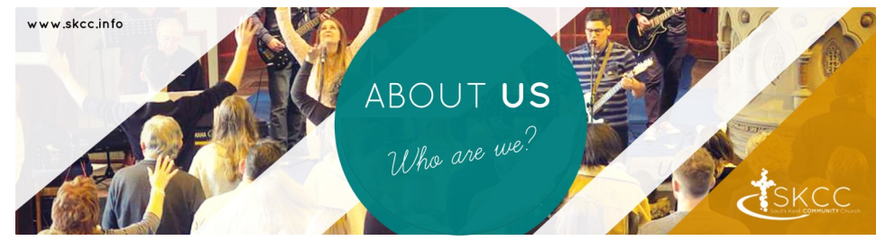
Who are we?? Sunday 22nd April 4.00 p.m. at The Cornerstone Centre

5.00- 7.00 p.m. at Willetts House, Saltwood.