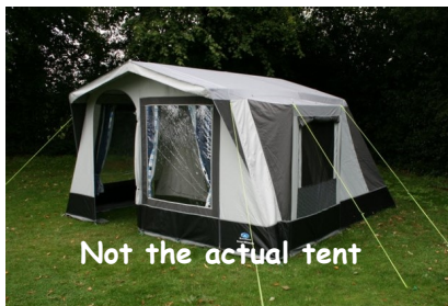
Not the actual tent

The final early booking period (a saving of around 5% of full price) ends at midnight on Monday 2nd May . There will also be a deadline booking to guarantee camping with SKCC and a reminder will be made when that date is known.